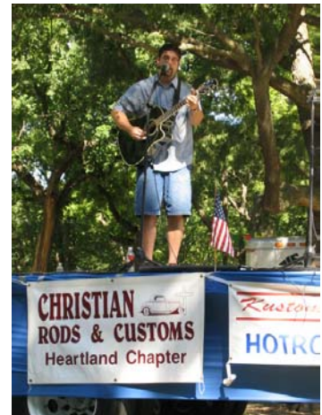
Church Service at KKOA Lead Sled Spectacular July 2006

Activities subject to change; please check our web-site for the latest to-date information up-and activities.