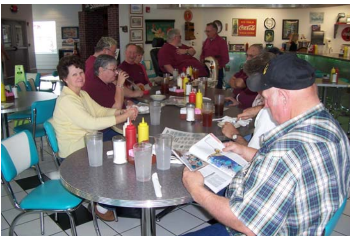
CR&C members lunching at the new Lucille's restaurant.

famous Route 66 authors and artists who strive to preserve the Road through their work. At the Car and Motorcycle Show, owners will showcase their well-preserved and restored vehicles from the past 100 years. The Route 66 Golf Tournament, Will Rogers Awards Banquet and many other events make the National Route 66 Festival a "must do" for the summer.