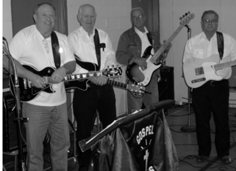
Gospel Light provides music and entertainment at our fourth annual April Sunset Cruise

Now the shows are about seeing friends. I only see some friends a couple of times a year at shows. The older I get the more impor-