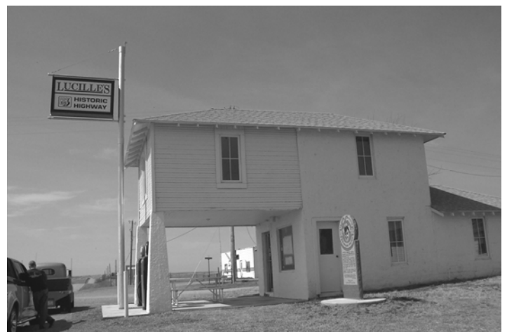
Lucille's is a historic site on Route 66.

Activities subject to change; please check our web-site for the latest up-to-date information and activities. (web address on this newsletter)