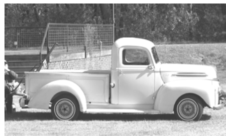
One of the Chapter members offered up his classic pickup to haul donations to the Helping Hearts storage facility after the Car Show was over.

Activities subject to change; please check our website for the latest up-to-date information and activities.