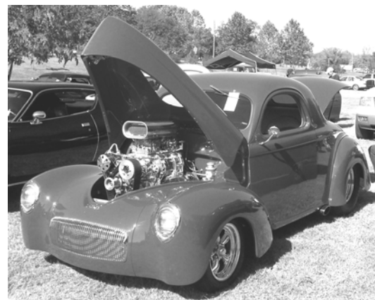
A bright red Willys always attracts crowds!