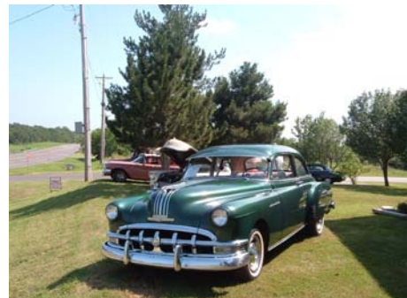
Club Chaplains ride. It looks just as nice in person!

Activities subject to change; please check our website for the latest up-to-date information and activities.