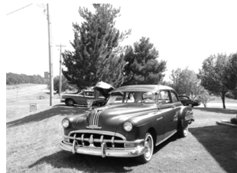
Chaplain's ride. It looks just as nice in person!